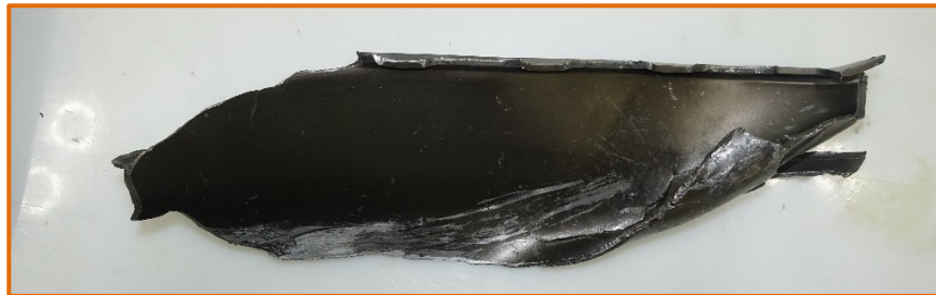
Examples of parts from the engine when dismounted

Anyone who may have found one of these pieces is invited to follow the protocol below: